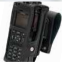
Hard leather case with 3" swivel belt loop, fits simple and full keypad models.

Enhanced receiver sensitivity and DMO repeater functionality means excellent coverage in buildings and over extended areas.