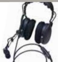
Dual-muff over the head headset with boom microphone and in-line push-to-talk, 24 dB NRR.