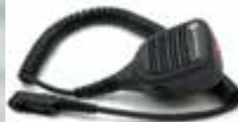
Enhanced large remote speaker microphone with noise-canceling microphone, loud audio, audio jack and emergency button, IP54.